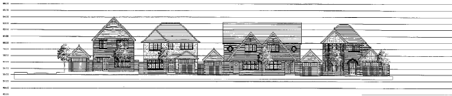
Street scene A-A

Elev 1 FFL 2.00m Elev 2 FFL 2.40m Elev 3 FFL 2.80m Elev 4 FFL 3.20m Elev 5 FFL 3.60m