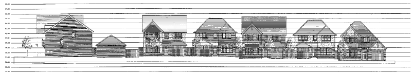
Street scene B-B

Elev 1 FFL 2.00m Elev 2 FFL 2.40m Elev 3 FFL 2.80m Elev 4 FFL 3.20m Elev 5 FFL 3.60m